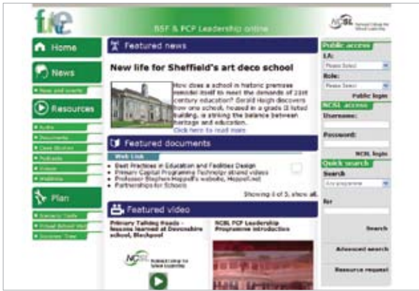
NCSL future website