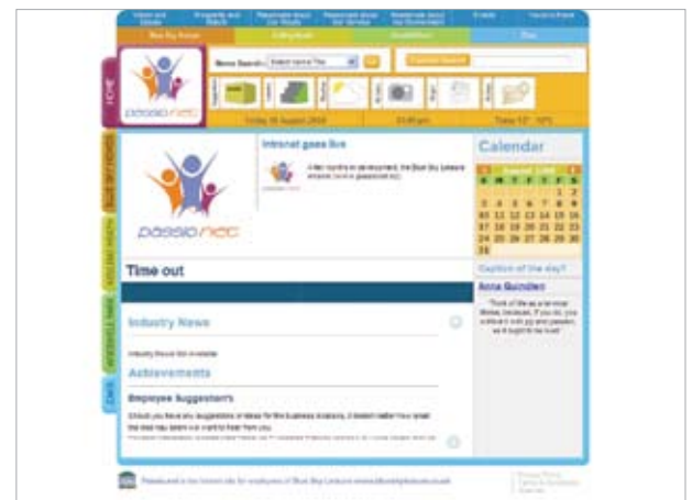
Passionet Company intranet for Blue Sky Leisure