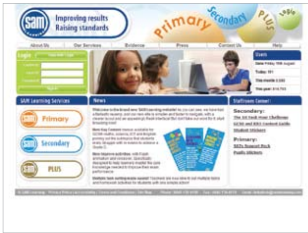
SAM Learning We designed the website for this leading online revision service