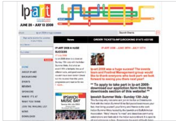
Ipswich Art Festival Website