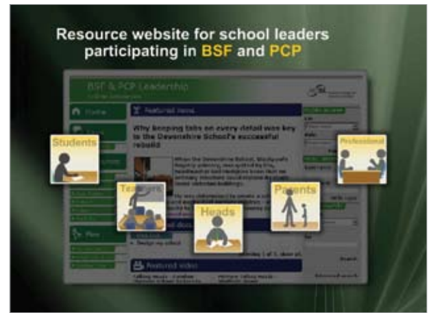
Future Video A video trailer to launch the new NCSL future website