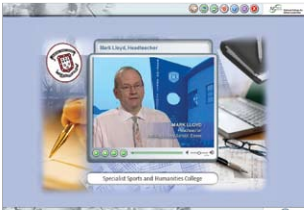
NCSL Virtual School Visit