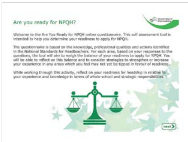
NCSL Am I Ready? Diagnostic tool